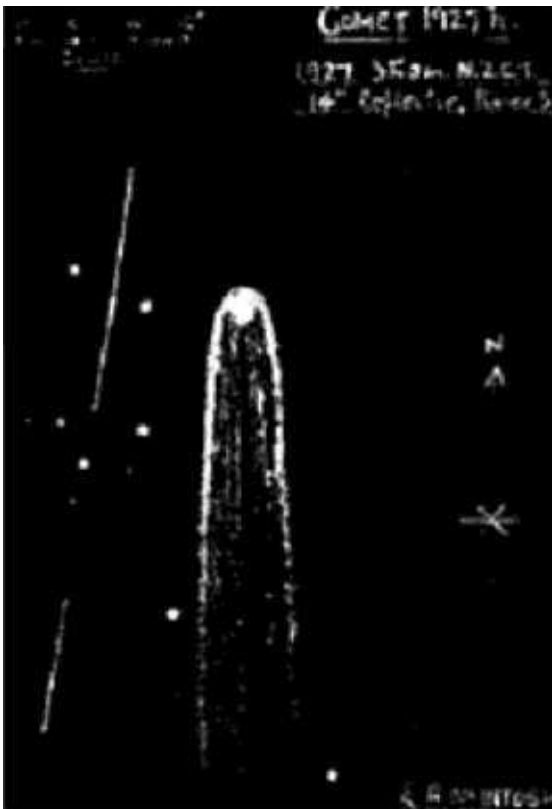
Figure 5: Drawing of Comet Skjellerup-Maristany by R.A. McIntosh on 5 December 1927 (Orchiston Collection).

In 1910, the world awaited the return of the famous Comet 1P/Halley in May. However, the unexpected arrival of a bright comet in mid-January created much fear and awe (e.g. New York Times , 1910; Burnham, 2000: 184). Deemed the Great Daylight Comet of 1910 (see Figure 4), it was bright enough to be seen