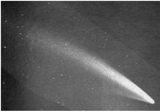
Figure 4: The Great Daylight Comet of 1910 appeared just four months before Comet Halley but was brighter than Venus at its peak (image rotated clockwise by 90°).

ful that Ilpailurkna had saved them. 6 In the eyes of the community, had Ilpailurkna not driven the comet away, it would have fallen to Earth as a bundle of spears and everyone would have been killed (ibid.: 630).